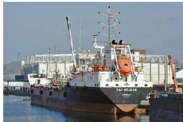
The 3,536dwt tanker Cap Mejean, above, is one of the ships which are set to benefit from new French rules requiring an increased proportion of the country's domestic crude oil and refined products to be carried by French-flagged vessels. Four operators — including Cap Mejean's owner CFT, Socatra, Euronav and Sea tankers have been selected for the work.