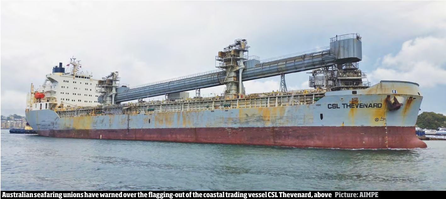
Australian seafaring unions have warned over the flagging-out of the coastal trading vessel CSL Thevenard, above.