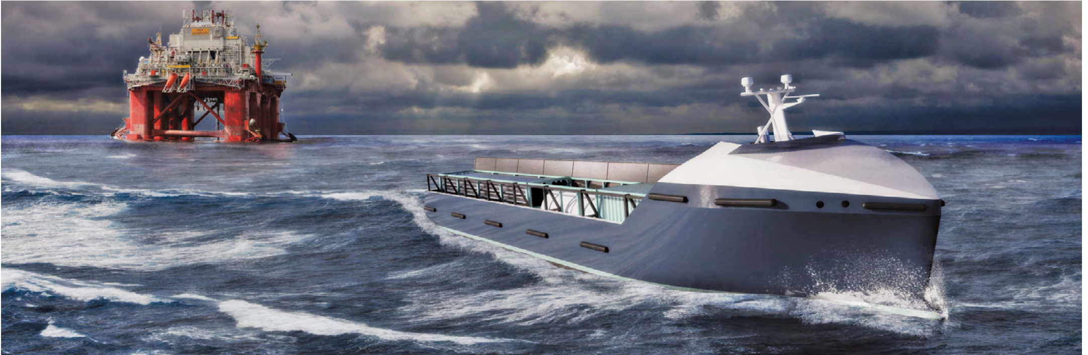
Pictured above is Rolls-Royce's vision of an automated offshore supply vessel. The company says the sector could be one of the first to regularly use 'smart' ships.