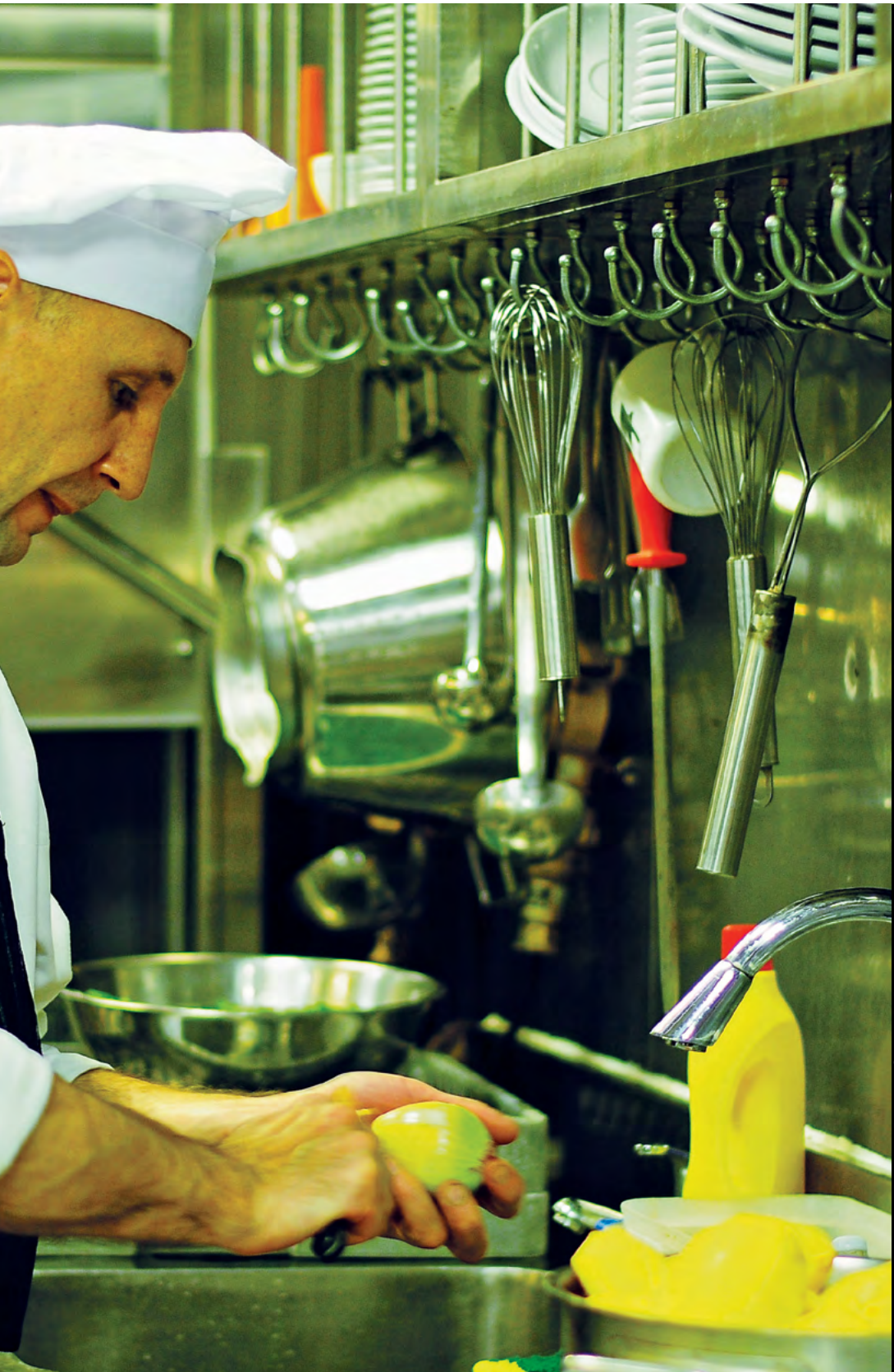
Fresh vegetables are improving seafarers' physiques, but more attention needs to be paid to their mental health.